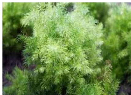
Figure 2. – Shatavari