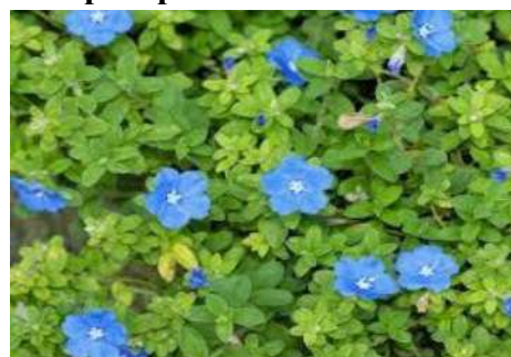
Figure 6. – Shankhapushpi