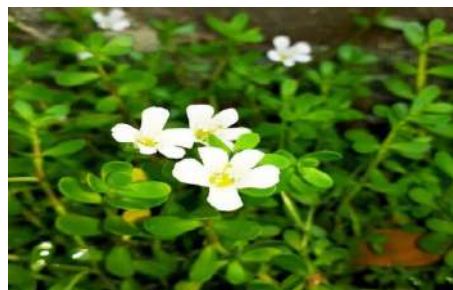
Figure 3. – Brahmi