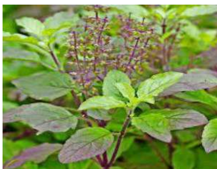
Figure 5. – Tulsi