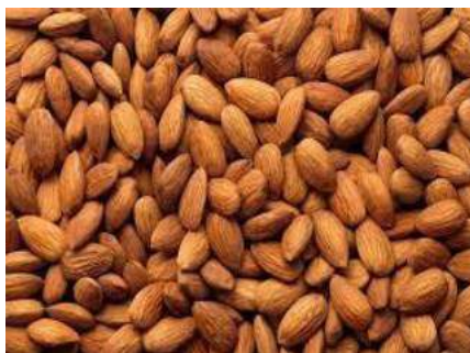
Figure 4. – Almonds