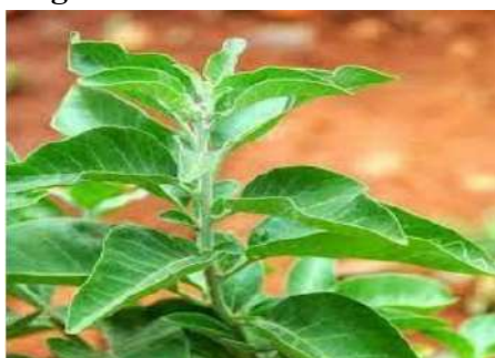
Figure 1. Ashwagandha