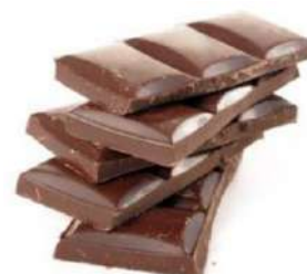
Figure 6. – Herbal Dark Chocolate INGREDIENT TABLE