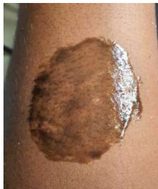
Fig: Peel off Test