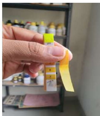
Fig: pH Test - 6.5