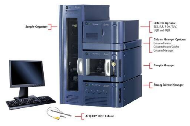
Figure 3: UPLC instrument