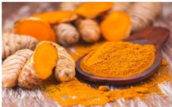
Figure no:5 Turmeric