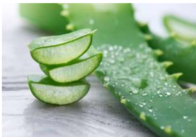
Figure no:4 Aloevera