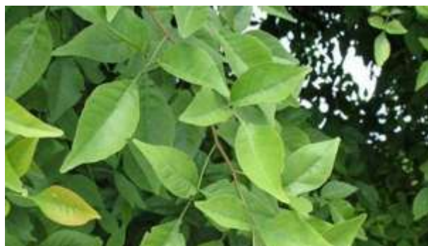
Figure no: 3 bel patra