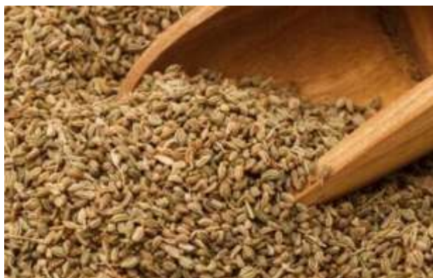
Figure no 2 : Ajwain