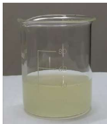
Figure 12: Aloe Vera Extraction