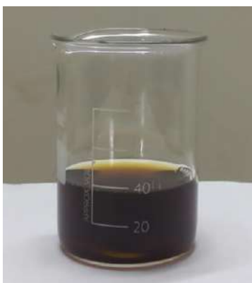
Figure 10: Beal Leaves Extraction