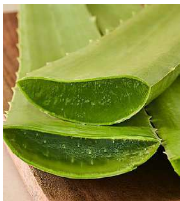
Figure 4: Aloe Vera