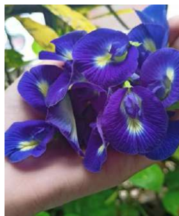
Figure 1: Shankpushpi