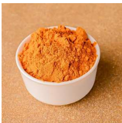
Figure 5: Turmeric