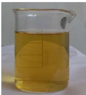
Figure 13: Orange Peel Extraction