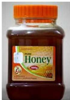
Figure 8: Honey