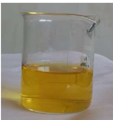
Figure 11: Turmeric Powder Extraction