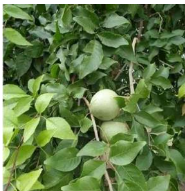
Figure 2: Beal