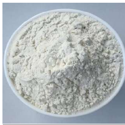
Figure 7: Guar Gum