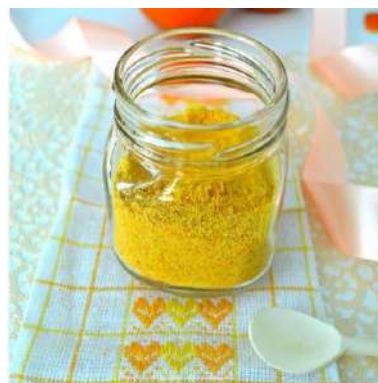
Figure 6: Orange Peel Powder