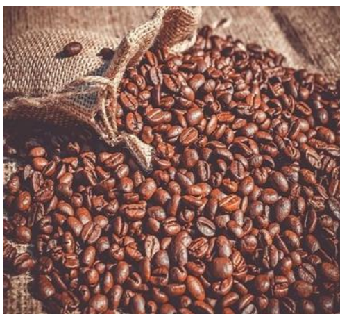
Fig. 1 (Coffee Beans)

and coconut oil, creating a product that helps retain moisture, soothes dry, chapped lips, and prevents further dehydration.