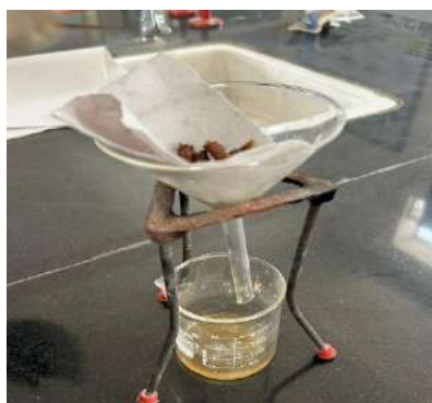
Fig no 1 : Formulation of herbal syrup