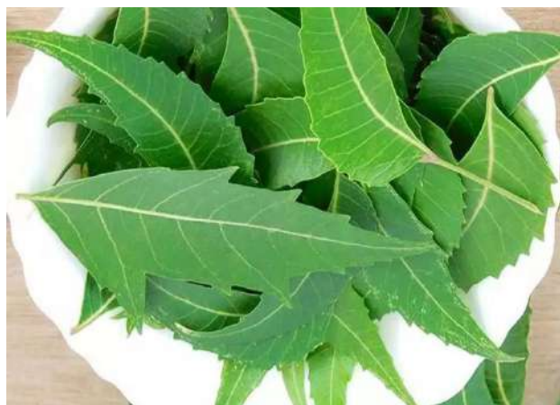
Fig no 1 Neem