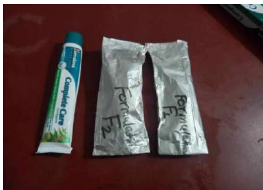
Figure 2. Formulation of Herbal Toothpaste F1 and F2