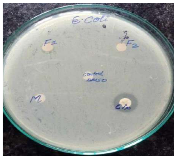
Figure 6. Zone of Inhibition (ZOI) of E. coli and S. aureus against the formulation F1, F2 and Marketed herbal toothpaste