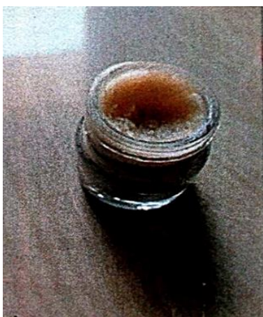
Fig. Antiaging Cream