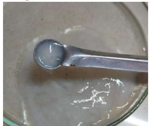
Fig 3. Gel after extraction Table 1: Formula for preparing Herbal serum