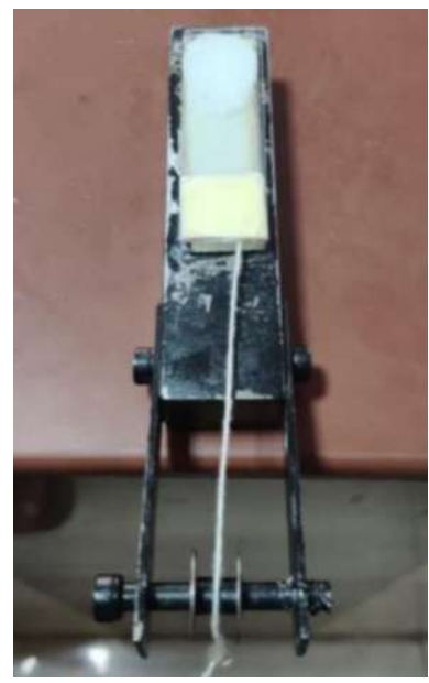
Fig 7. Spreadability test