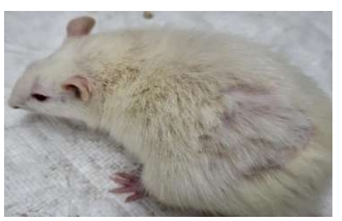
Fig 9. After 14 days