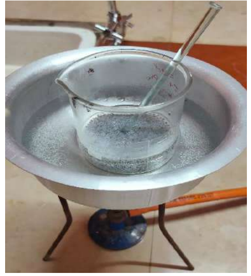
Fig 2. Basil seeds in water bath

added to the aqueous phase drop by drop under homogenization at 3.4 to get oil in water biphasic emulsion.