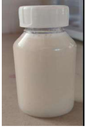
Fig 4. Serum

liquid preparation and the colour translucent white.