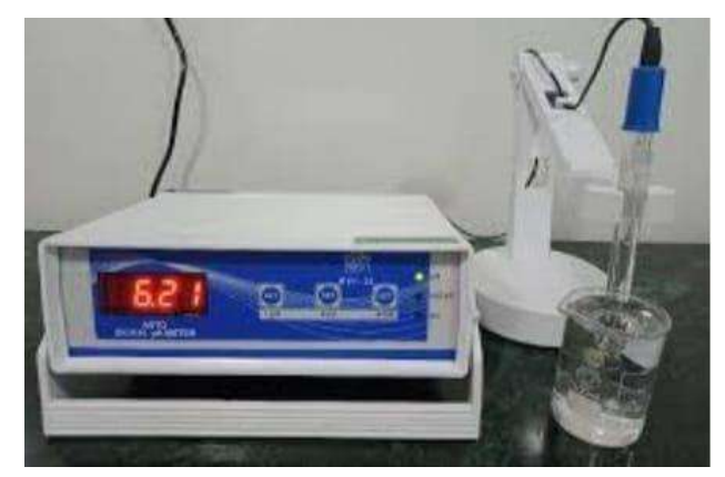
Fig 5. pH meter Globule Size Determination:

The normal pH of the skin ranges between 4.0 to 7.0^{[10]} . The pH of this serum was evaluated by using a pH meter and found to be 6.9.