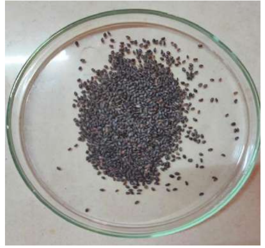
Fig 1. Basil seeds MATERIALS AND METHODS Materials

Almond oil contains fatty acids and minerals which help to reduce scars, stretch marks, wrinkles and many other skin conditions <sup>[6]</sup>. Vitamin E boosts collagen production in the skin <sup>[7]</sup>.