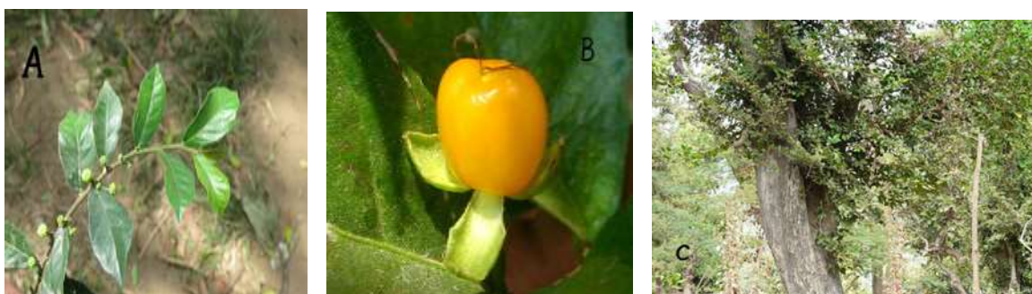
Figure 1 showing S. asper Lour tree A) Leaf B) Fruit C) Whole tree

Thailand is denoted as the native of Streblus asper Lour , and it was applied in phytomedicine for the healing of diverse autoimmune diseases [4] . Sahada( S. Asper ) was an everyday language used by sandal tribes of Odisha to perform mechanism towards treating pustules and dysentery's [5] . Asia is considered a point of Vast distribution of Streblus asper , leading in India, Thailand, Sri Lanka, Bangladesh, Vietnam, Cambodia, Philippines, China and Malaysia, especially in moist, unsealed and dry plains, with coastal regions [1,6] . From January to March and April to May, consider it a time of fruiting and flowering period. Streblus asper falls under inconsequential nutritional and supplement fruits of Odisha and is also well known as the toothbrush tree [7] . S. asper was referred to as “mittli mara”, as reported by the Indian herbal medicine census. The root extract of S. asper is employed by the Marma tribes in Bangladesh to manage rural irregularities and to postpone menstruation [8] . In this established practice, the S. asper was applied as an ingredient for maintaining durability [9] .