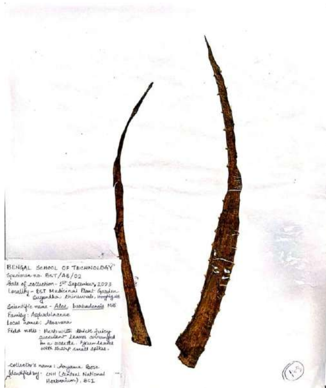
Figure 2: Herbarium of Aloe barbadensis