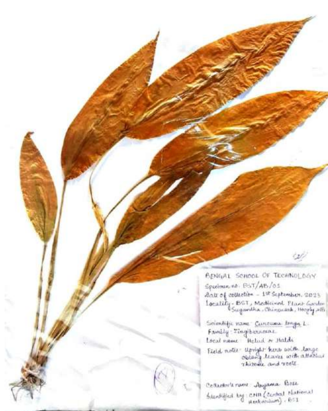
Figure 4 : Herbarium of Curcuma longa (own picture)