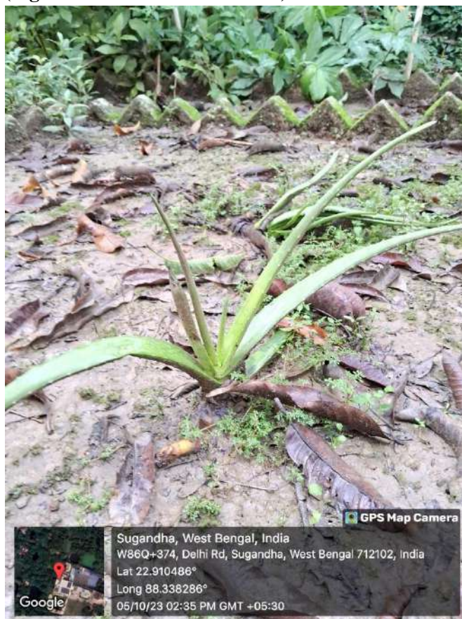
Figure 3: Aloe Vera Plant in BST Herbal Garden