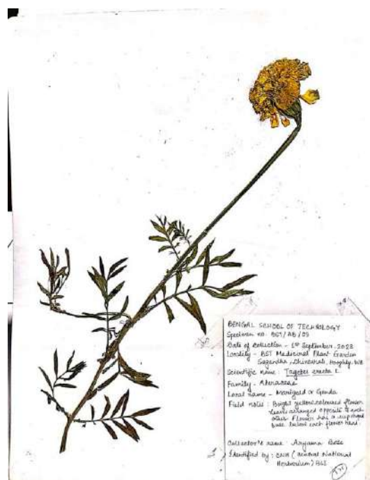
Figure 6 : Herbarium of Tagetes erecta