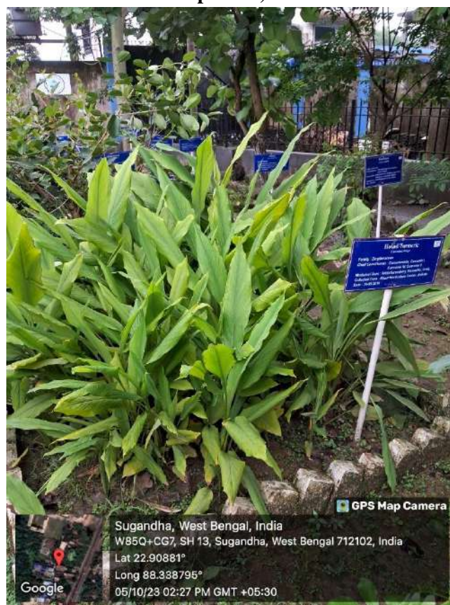
Figure 5 : Turmeric Plant in BST Herbal Garden